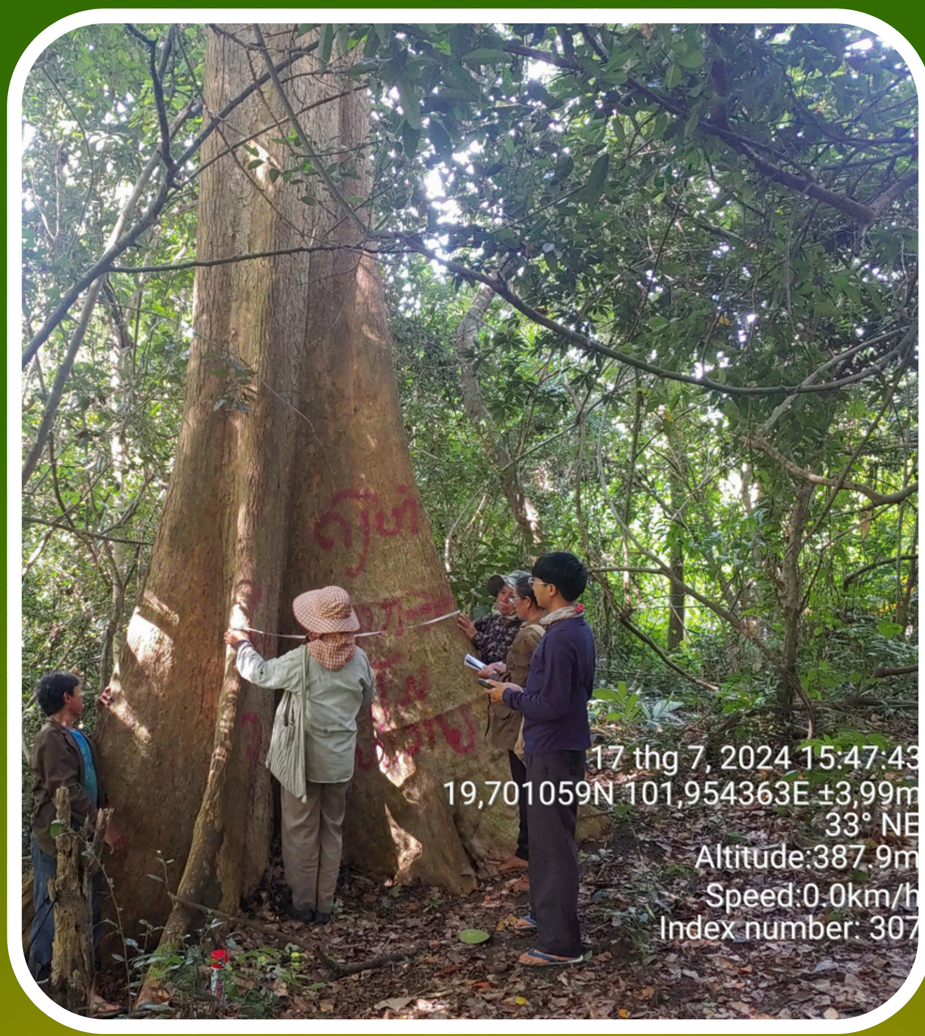
May Hen (Laos) 3,435.54 kg of Carbon => 12,597 kg of CO2 Equivalent Equivalent to 25,816 VND per tree per year