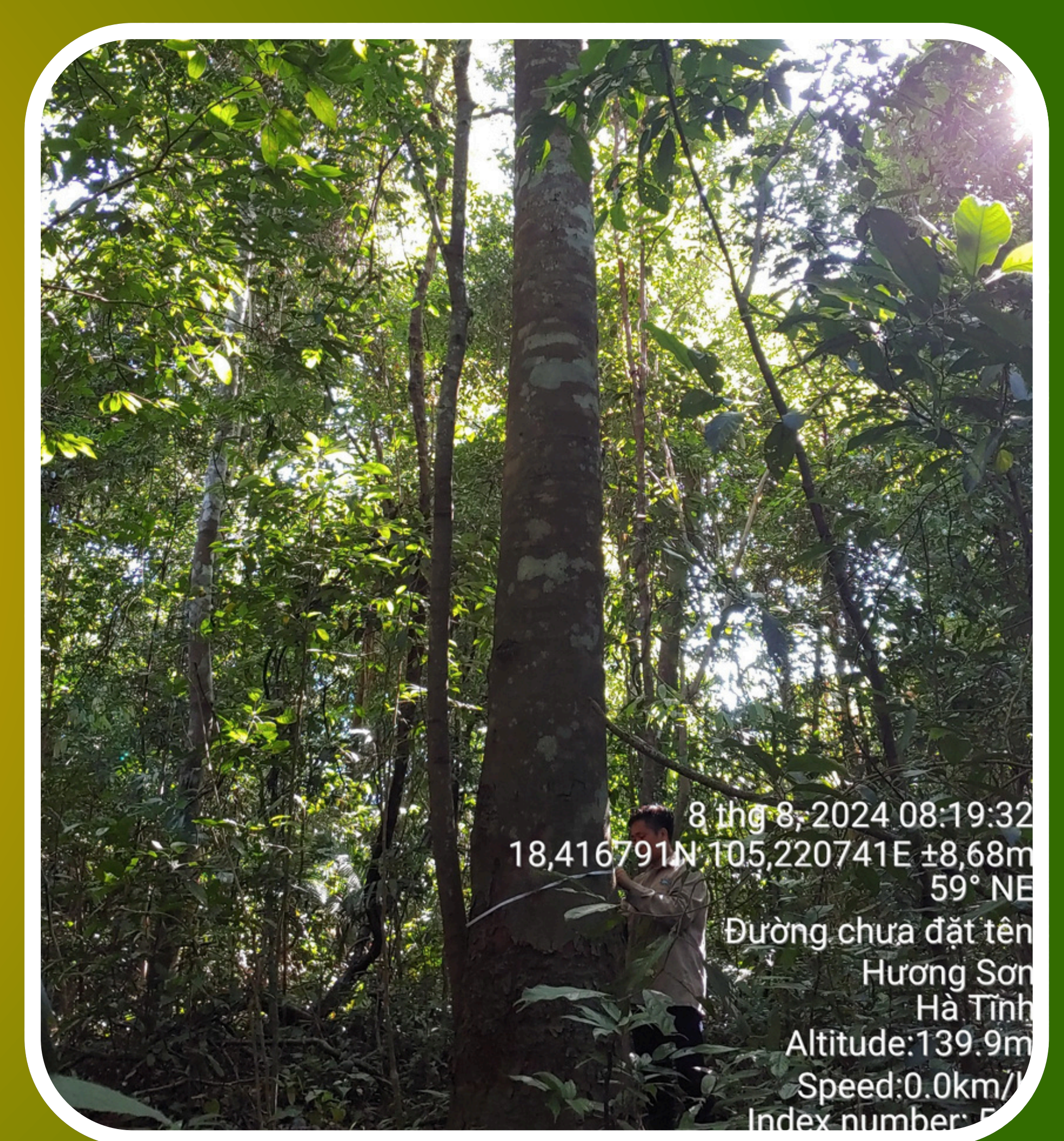
Erythrophleum fordii 1,618.79 kg of Carbon => 5,935.56 kg of CO2 Equivalent Equivalent to 17,733 VND per tree per year