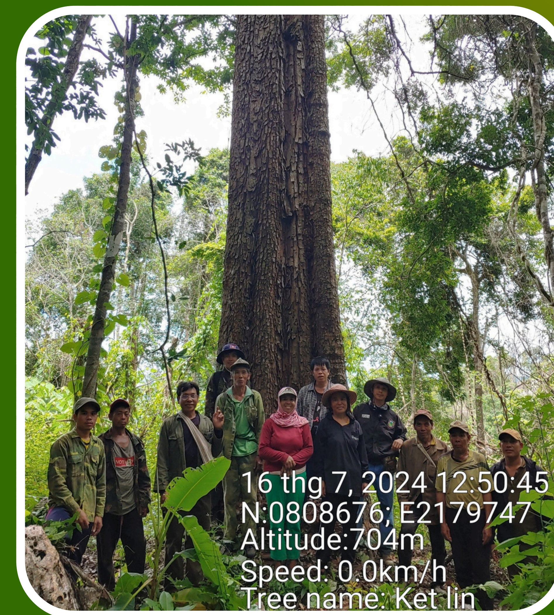
Ket Lin (Laos) 14,947.35 kg of Carbon => 54,807 kg of CO2 Equivalent Equivalent to 68,838 VND per tree per year