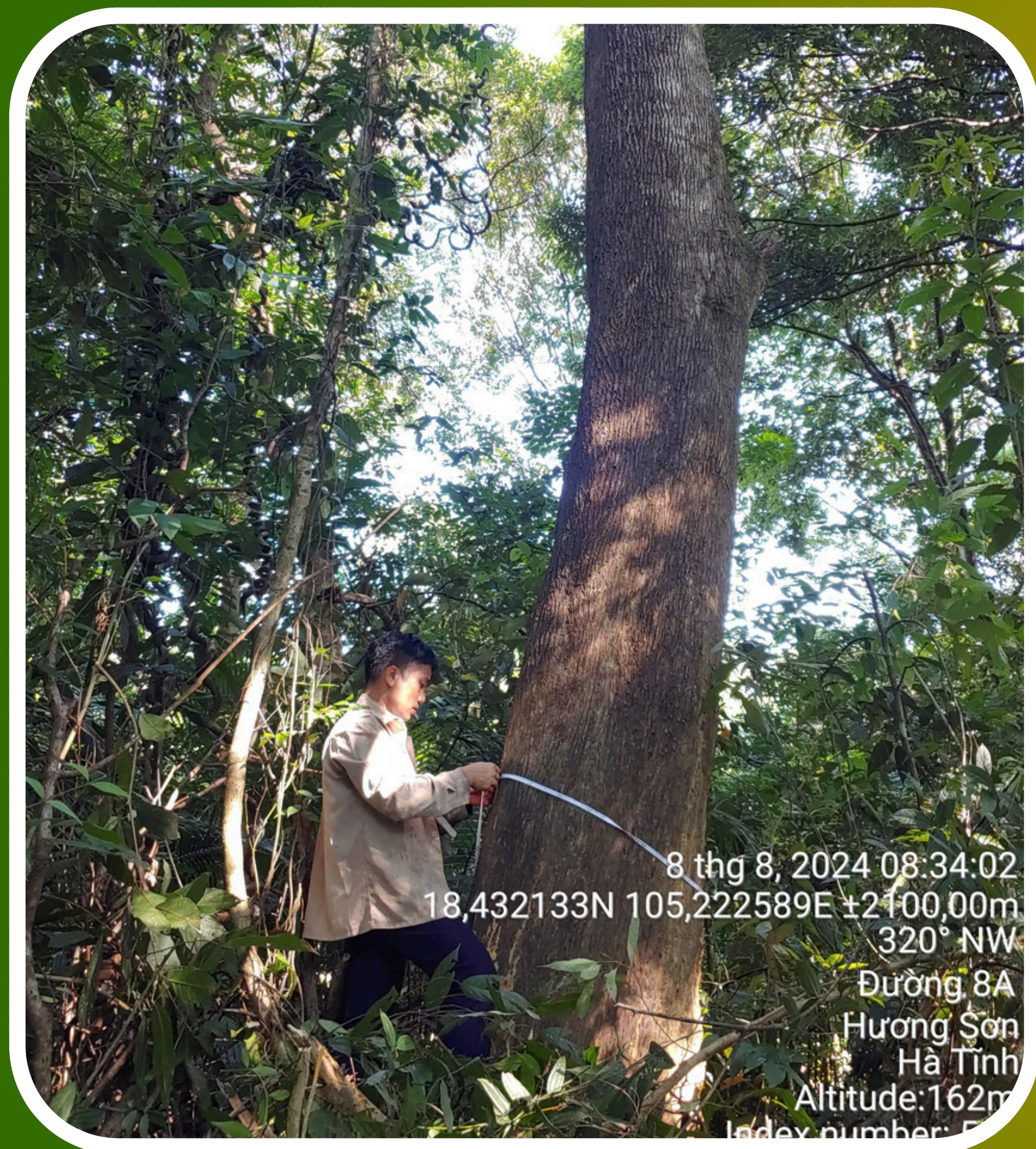
Engelhardtia chrysolepis Hance 1,685.18 kg of Carbon => 6,178.99 kg of CO2 Equivalent Equivalent to 17,444 VND per tree per year