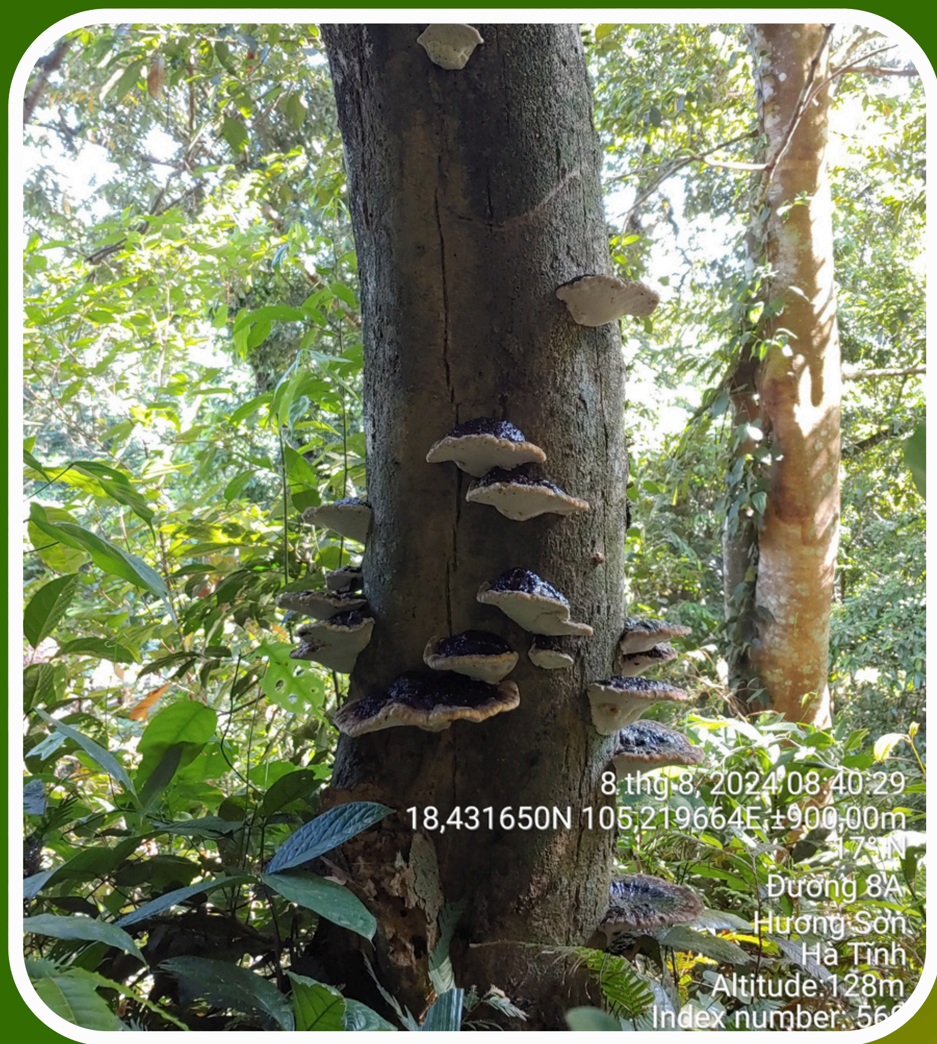
Ganoderma lucidum Herbs