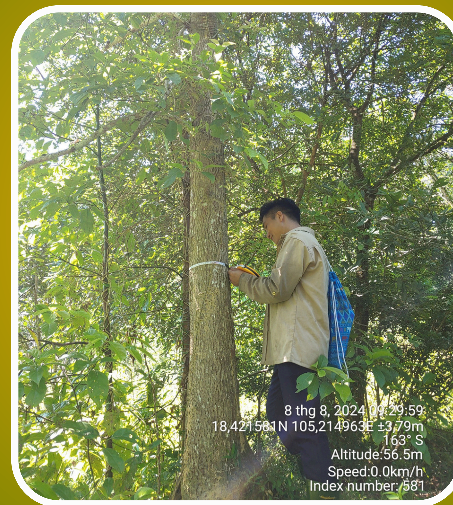
Cinnamomum parthenoxylon. Lauraceae 83.18 kg of Carbon => 304.98 kg of CO2 Equivalent Equivalent to 2,607 VND per tree per year