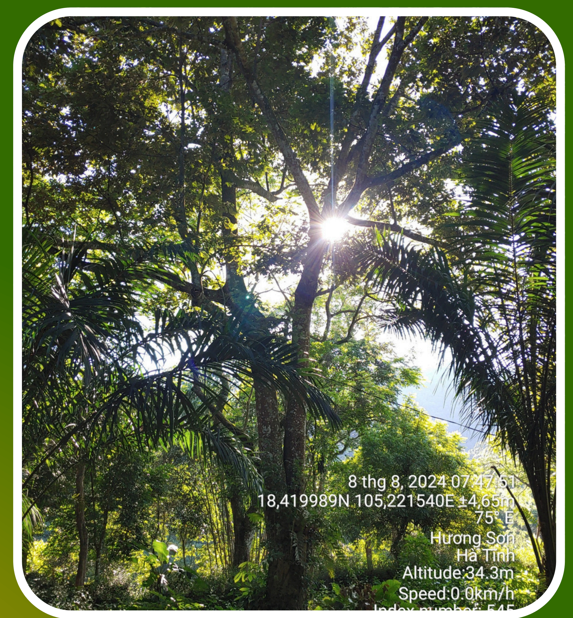
Castanea sativa 1,183.20 kg of Carbon => 4,338.39 kg of CO2 Equivalent Equivalent to 14,202 VND per tree per year